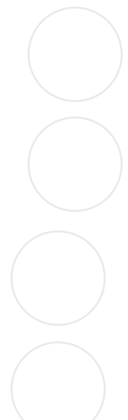
Extra B \sharp & B \natural keys